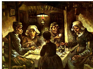
The Potato Eaters