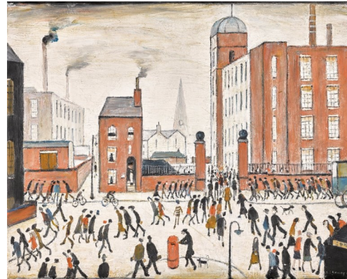
Going to Work