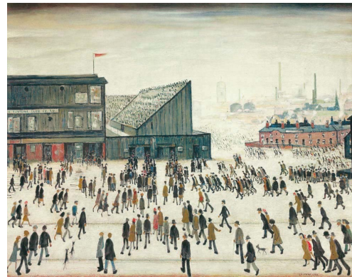
Going to the Match