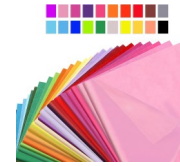
Tissue paper/ Coloured card