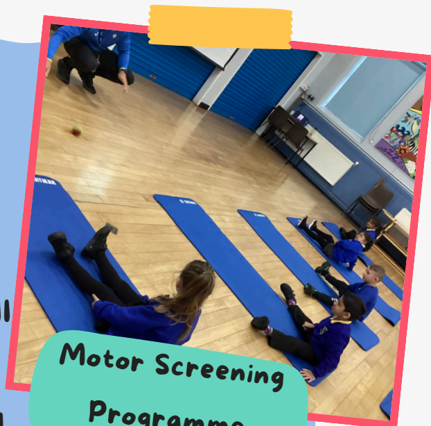
Motor Screening Programme

Red Class have been taking part in the afPE Early Years Motor Screening Programme. The programme has been designed to support their journey toward developing strong motor skills. The children will participate in small group sessions on Monday, Wednesday and Friday mornings. These sessions, along with a high quality PE lessons will give the pupils the best possible foundation in motor competency.